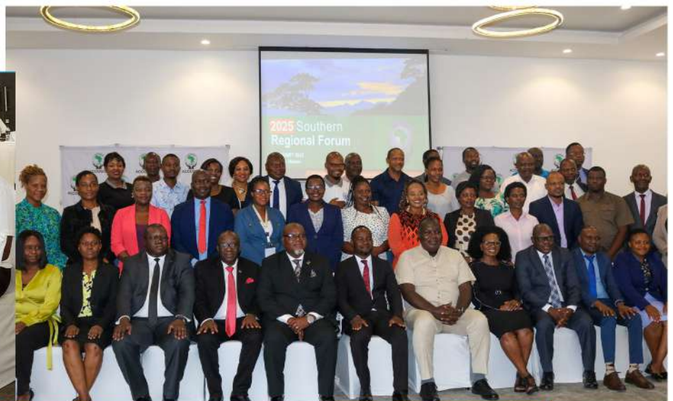
Some of the dignitaries at the forum

Cooperators from various countries including Eswatini, Botswana, Namibia and Zimbabwe attended the forum.