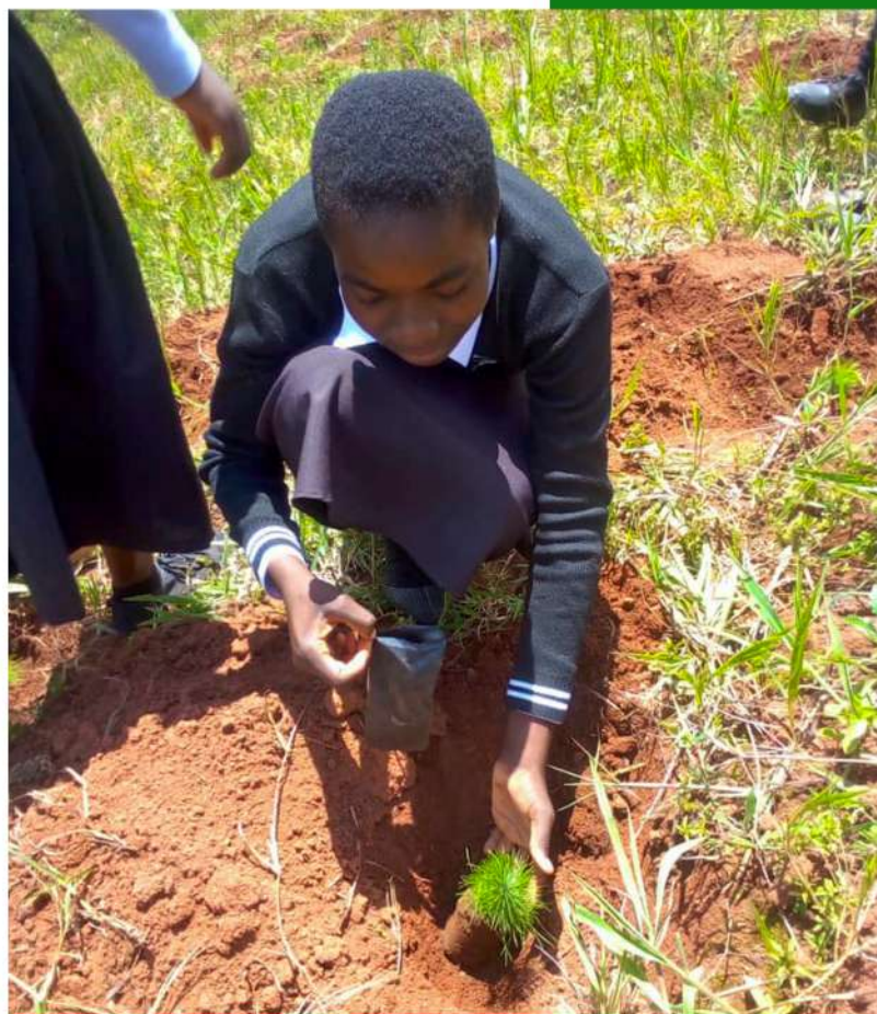
A student planting a tree at Masasa CDSS