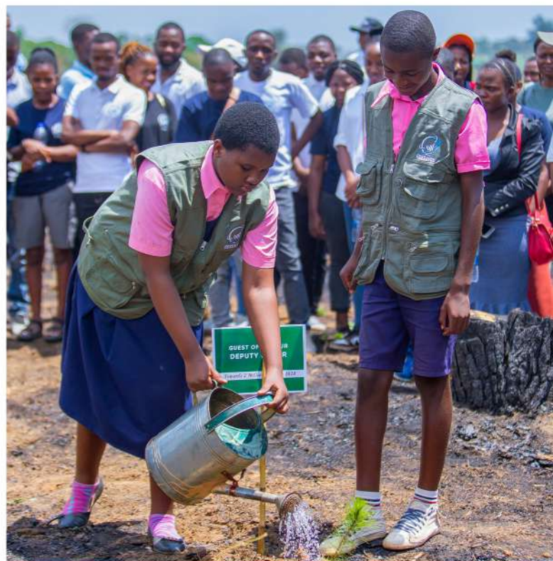
Katoto Primary students watering a newly plated tree

United Civil Servants SACCO is planting trees with students in schools throughout the country through its branches as one way of mentoring the students ( while they are young ) to care for the trees.