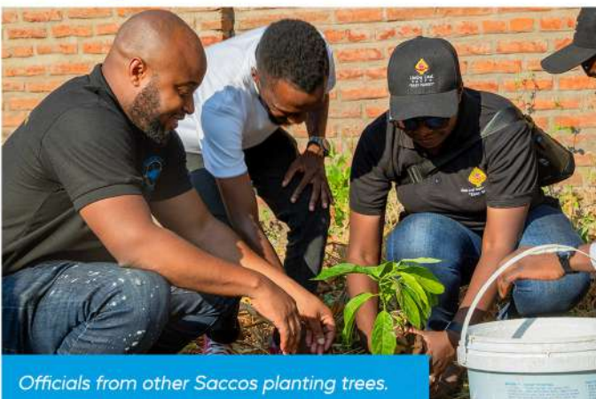
Officials from other Saccos planting trees.

Established by the missionaries in 1970, the resource centre is under Salima LEA primary school. United Civil Servants SACCO started supporting the resource centre in 2018. Among other things, UCSSACCO constructed a fence around the resource centre, rehabilitated classrooms, provided braille materials as well as ensuring that the kids have their daily meals.