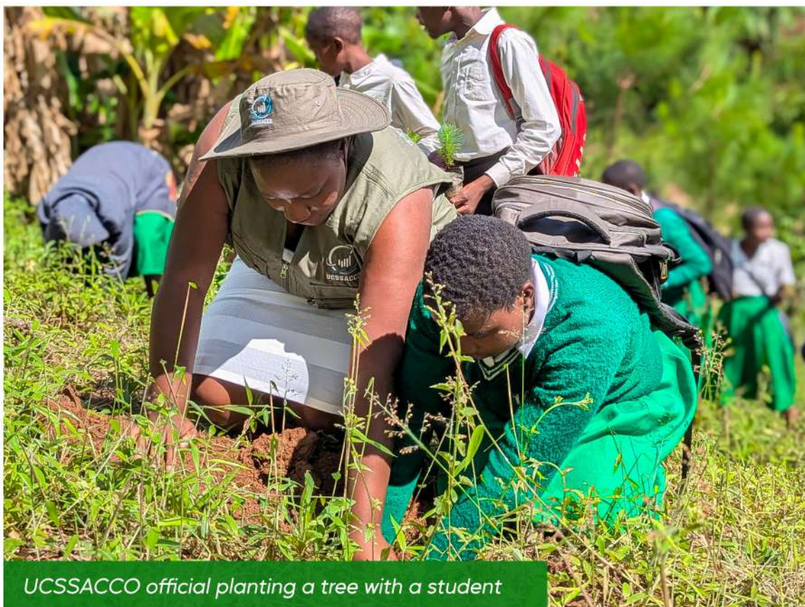
UCSSACCO official planting a tree with a student